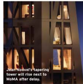
Jean Nouvel's tapering tower will rise next to MoMA after delay.