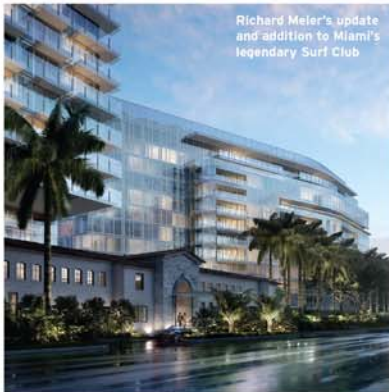
Richard Meier's update and addition to Miami's legendary Surf Club

tag—construction bids came in up to $42 million, markedly higher than the $28.6 million allocated for the project. To reduce costs, Holl's elaborate design was toned down and the project finally broke continued on page 5