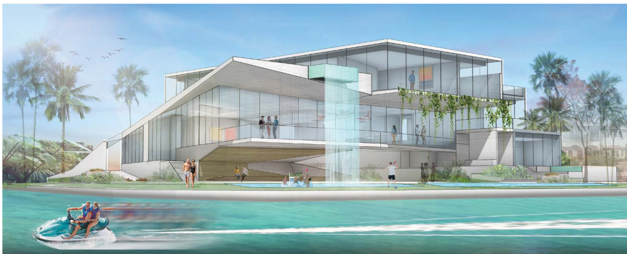
BELOW: Surf Row in Surfside will be comprised of eight beach homes at 8000 Collins Avenue.