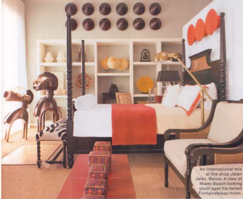
An international mix at the shop Jalan Jalan . Below: A view of Miami Beach looking south past the famed Fontainebleau hotel.

when Henry Flagler first extended his railroad down the East Coast and made Miami a booming port city. Coral Gables's elegant Biltmore hotel, designed by Schultze and Weaver in 1926, was a famous tropical stopover for the Duke and Duchess of Windsor (as well as the place Johnny Weissmuller taught swimming before he was discovered by Hollywood), but had been transformed into a hospital and then largely abandoned by the late 1960s. In 1983, Coral Gables awarded the structure landmark status and it was renovated as a resort. The current owners have spent another $40 million, recently completing a ten-year refurbishment. Miracle Mile —actually only a half-mile stretch of Coral Way—has also been cleaned up, with trendy stores, antique shops, and galleries.