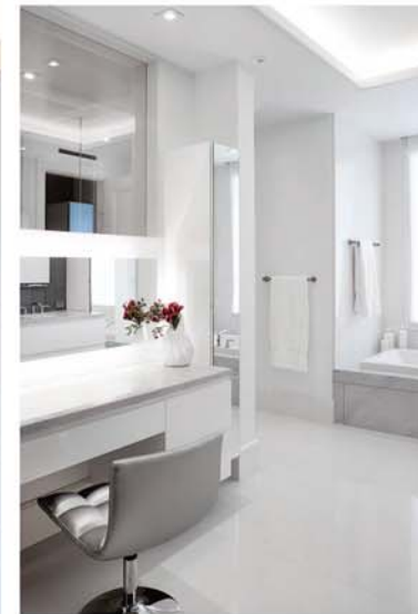
En Suite In the master bathroom (above), the vanity and tub deck are covered with Blue Cielo marble. The white lacquered cabinetry is designed by Daniel Popescu for Biotta Kitchens. The neutral vanity chair wears Suddern vinyl from Maharani, and the radiant-heated floors are covered with slabs of Bianco Sivec marble. See Resources.

you can do with the current technology, and it's all so much more efficient." The energy-saving lighting is a small part of the environmentally conscious construction that features solar panels, geothermal heating, multi-glazed thermal glass windows and radiant-heated floors. "The children love to be able to walk barefoot in the winter when there's so much snow outside," notes Brewer.