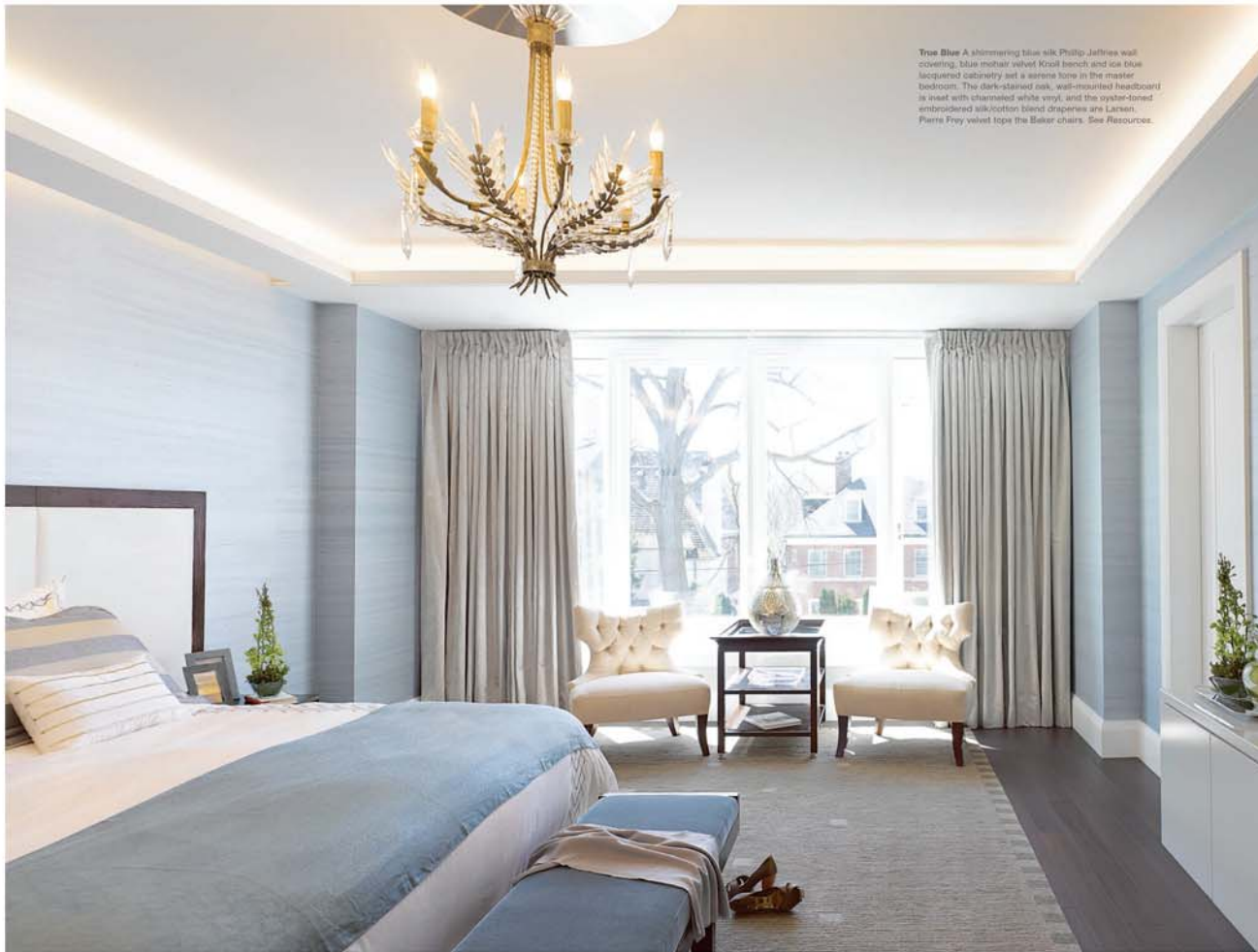
True Blue A shimmering blue silk Philip Jeffries wall covering, blue mohair velvet Kratz bench and sea blue lacquered cabinetry set a serene tone in the master bedroom. The dark-stained oak, wall-mounted headboard is made with charmed white vinyl, and the oyster-finished embroidered silk/cotton blend draperies are Larkspur. Pierre Frey velvet tops the Baker chairs. See Resources.